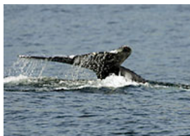
» Navy resumes use of sonar off California